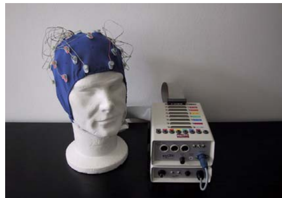
Figure 2. Portable EEG system used at the IDIAP Research Institute. It is a commercial BioSemi ActiveTwo system

EEG signals are acquired with a portable acquisition system such as the one shown in Figure 2. Subjects wear a commercial EEG cap with integrated scalp electrodes that cover the whole scalp and are located according to the 10/20 international system or extensions of this system to allow recordings from more than 20 electrodes (i.e., the 10/10 system)..